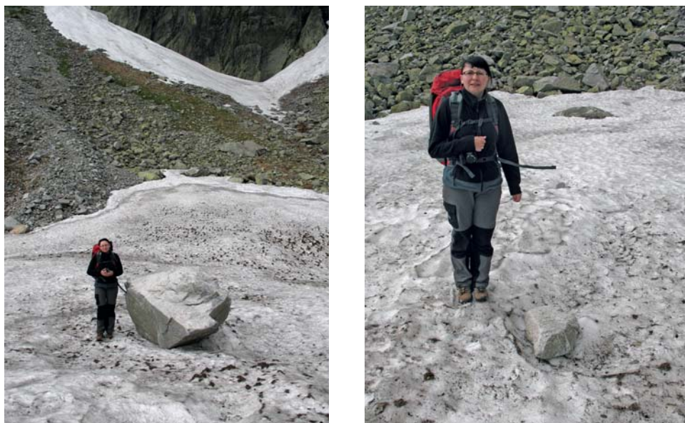
Fig. 7. Photos present boulders on the surface of a snow patch in the Buczynowa valley (by S. Kędzia, 2/07/2014)

The lack of lichens on the surface of boulders may not always be due to a supply of fresh material from the slopes, or the movement of material forming the rock glacier. Figure 10 shows a place with a residual snow patch. In places where snow is overdue, the colonization of rock surfaces by lichen is very difficult, and sometimes impossible (H a e b e r l i et al. 1979). In the place shown in the picture, every year, or every few years, snow remains long enough to prevent