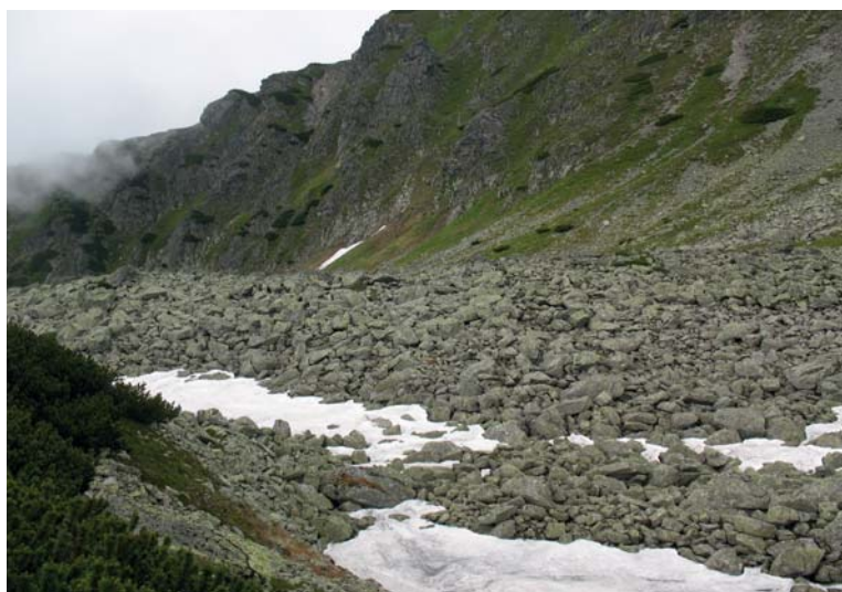
Fig. 5. The surface of the rock glacier in the Świstówka Roztocka valley (by S. Kędzia, 1/07/2014)

lichens reached about 110–140 mm. The lichen factor for the height interval in which the measurements were made is between 33 to 36 mm / 100 years, assuming that the lichens in these glacial cirques grow as fast as on the flat or convex forms of the slopes for which the lichenometric curve has been drawn. For the largest measured lichens, we can deduce ages, depending on the altitude, from about 360 to 420 years. At the same time, as stated above, the largest lichens were not the oldest. Currently, the existing living lichens on rock surfaces are of a subsequent generation.