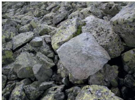
Fig. 8. A fresh boulder at the back of a rock glacier tongue in the Świstówka Roztocka valley (1/07/2014)