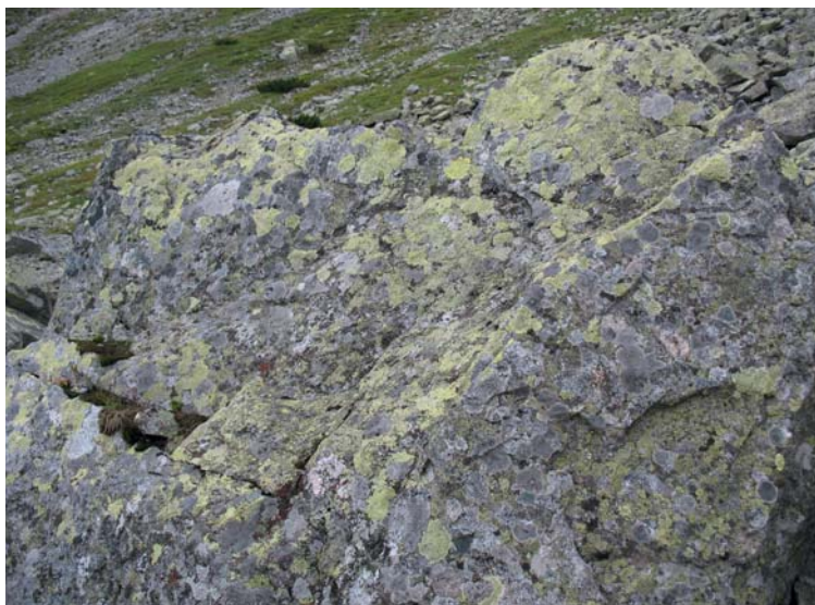
Fig. 4. Boulders of the rock glacier in the Świstówka Roztocka valley with several generations of lichens (by S. Kędzia, 1/07/2014)