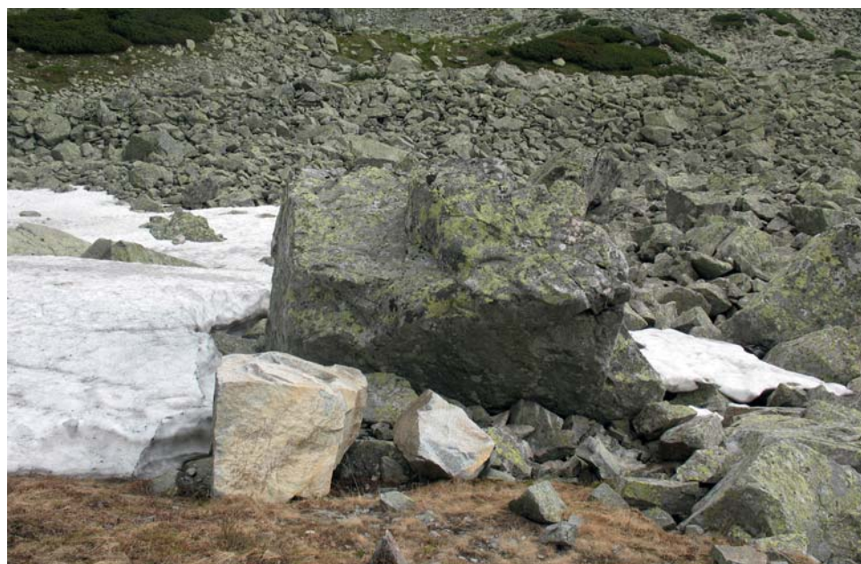
Fig. 6. Fresh rocky boulders at the limit of debris cover in the bottom of the Buczynowa valley (by S. Kędzia, 2/07/2014)

Figure 6 shows the edge of the rock rubble with a rock glacier visible in the background. In the foreground, there are the remains of a snow patch, very old