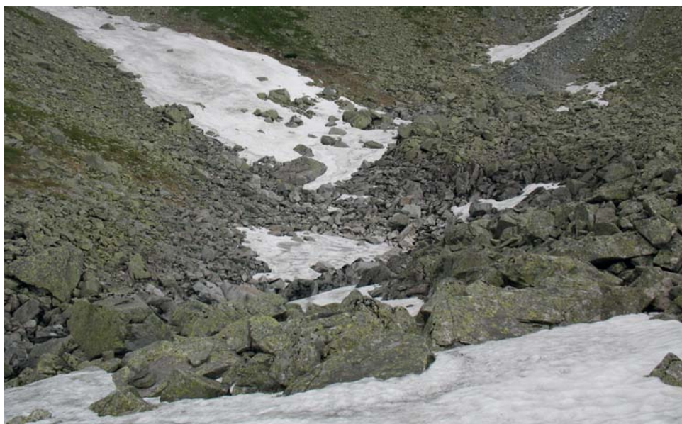
Fig. 10. Places devoid of lichens due to a long-lasting snow patch in the Buczynowa valley (by S. Kędzia, 2/07/2014)

colonizing the surface of boulders by lichens. A lack of lichens is therefore not the result of a movement caused by gravity or freezing. It results only from a prolonged period of snow cover.