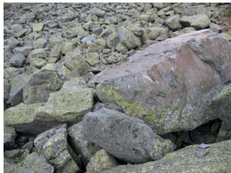
Fig. 9. A rotated and moved large boulder on a rock glacier in the Świstówka Roztocka valley (by S. Kędzia, 1/07/2014)