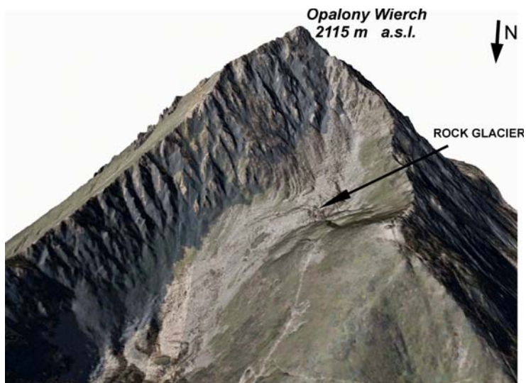
Fig. 3. The rock glacier in the Świstówka Roztocka valley

of the Kozi Wierch peak (2291 m a.s.l.), the Czarne Ściany peaks, the Granaty peaks and the Buczynowe Turnie peaks. The Buczynowa valley hang with a rocky step at a height of about 260 m to the Roztoka valley (Klimaszewski 1988). Lichenometric measurements were carried out on the rock glacier boulders on the upper level of the valley.